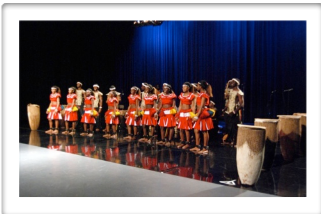
The Children of Uganda Tour of Light